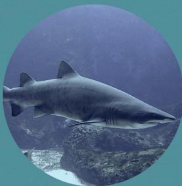
Grey Nurse Shark